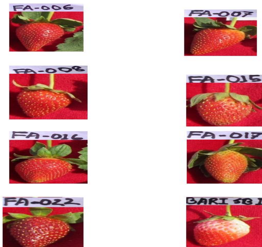
Fig-2. Fruit characteristics of eight strawberry genotypes