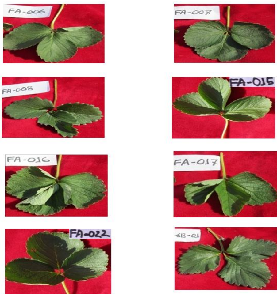
Fig-1. Leaf characteristics of eight strawberry genotypes