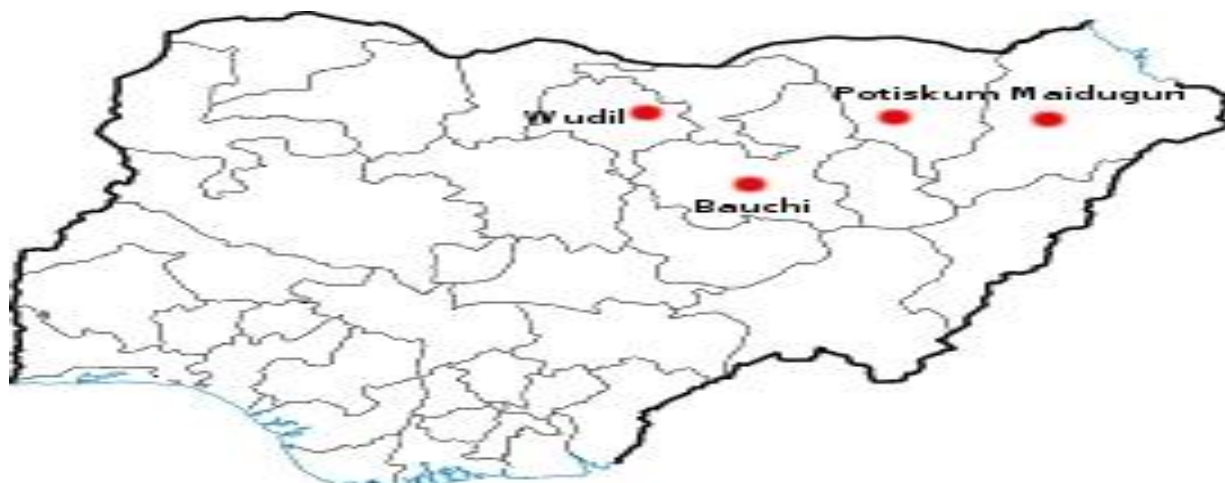
Figur-2.A Map of North-Eastern Nigeria Where Boko Haram Attacks Has Been Intense