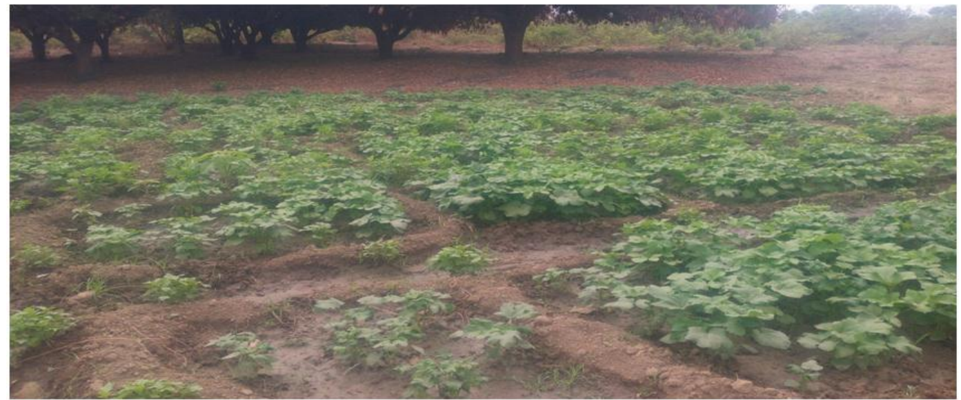
Plate-4. Irrigation Farming Within River Bank.

Irrigation farming alone with 79 accounting for 31.6% of the total agricultural activities with other remaining agricultural influence such as animal rearing and upland farming along the river with 96 accounting for 38.4% making a total of 175 accounting for 70% of the total agricultural activities shown in Table 3. Irrigation is the artificial application of water on farm crops in the dry season or during the drought period. It is the major contributor to water pollution especially during dry season period. It was observed that pesticide, fertilizer and other agrochemicals applied on the crops are washed directly into the water body. Chanchaga Town has the highest land area coverage for irrigation farming with about 70% and the remaining 30% for other areas along the study area. Irrigation farming practice is as presented in Plate 4.