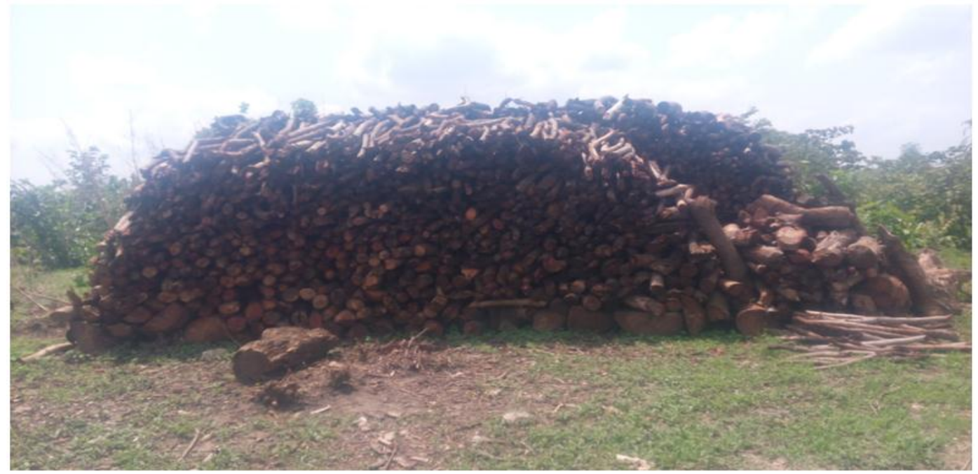
Plate-2. Deforestation for firewood along River Chanchaga