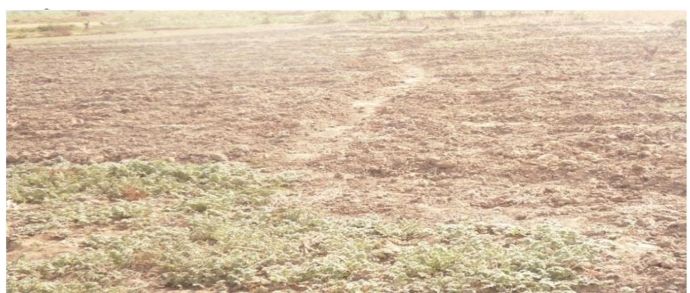
Plate-3. Land Clearance of over Fifty Hectare Due to Continuous Irrigation Farming Practices behindChanchaga Market