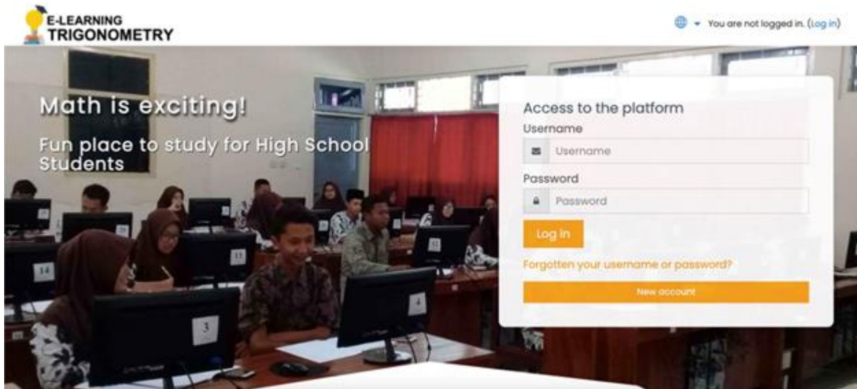
Figure-2. The frontpage of e-learning website.

E-learning was conducted using Moodle and included materials for each topic, media, assignments, discussion forums, and test items. The e-learning platform can be accessed through https://dewi-indrapangastuti.about.my.id as shown in Figure 2 below.