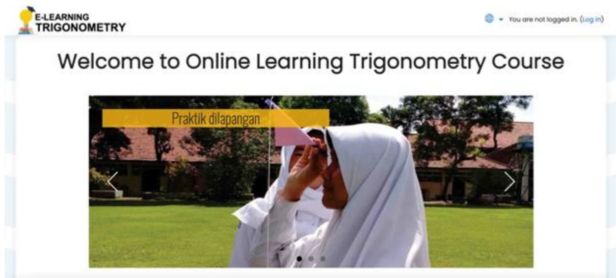
Figure-3. The e-learning homepage.

The website in Figure 2 appears when the e-learning users open the website. They are then requested to log in. The home page of the website can be seen in Figure 3: