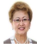
(*) Corresponding Author

1,5,6 NJSC Pavlodar Pedagogical University, Pavlodar, Kazakhstan.