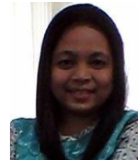
(✉ Corresponding Author)