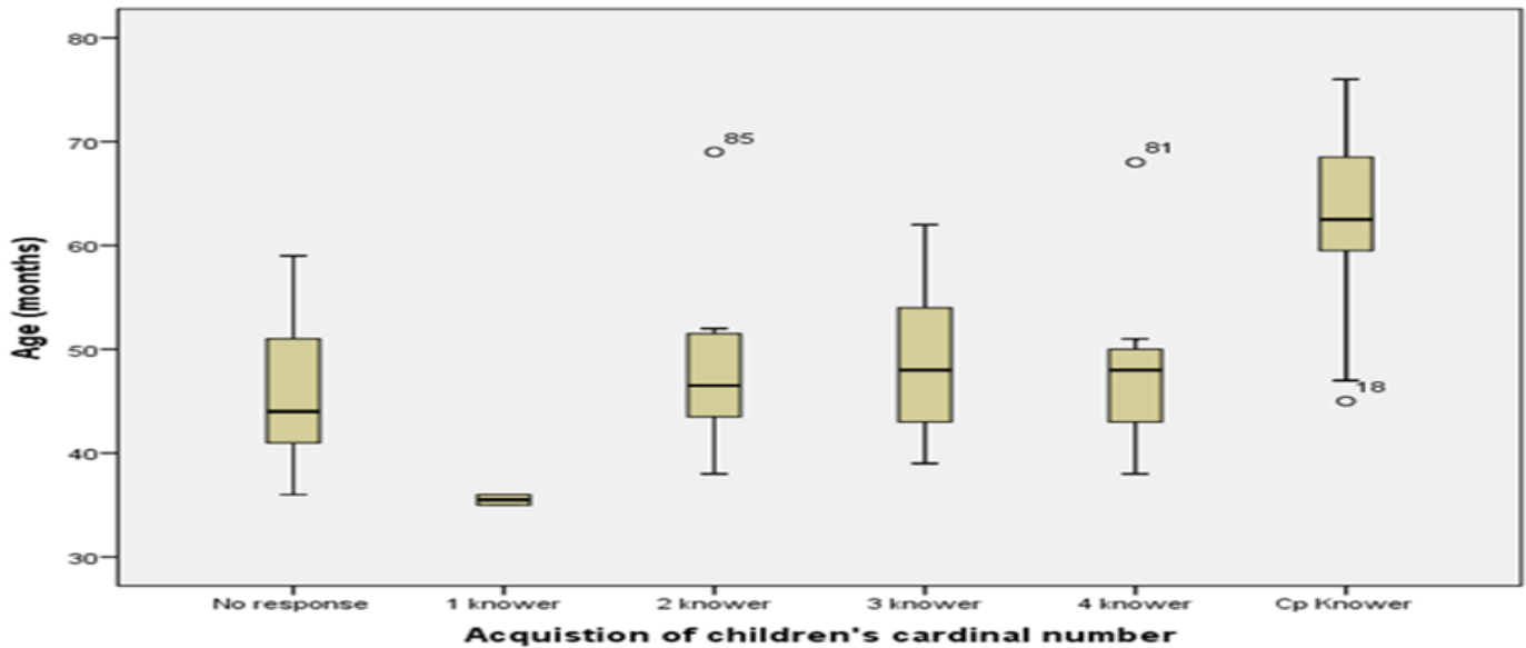
Figure-1. Shows a box plot chart for the acquisition of children's cardinal numbers.

Sixty percent of the children had cardinal number acquisition, 34% of the children were in subgroups, and 6% of the children were at the pre-number level. Among the children in the subgroups, two children put together one object, eight children put together two objects, 12 children put together three objects, and 12 children put together four objects. Four pre-number-level children used number words but did so incorrectly. Two of them did not use any number words or counting process.