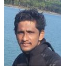
(✉ Corresponding Author)

1,2,3 National Center for Coastal Research (NCCR) NCCR Field Office, Ministry of Earth Sciences (MoES) Mandapam-623519, Tamil Nadu, India.