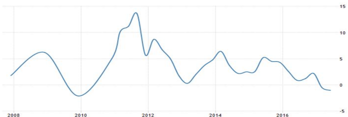
Figure-2. Annual GDP growth for the (2008-2016)