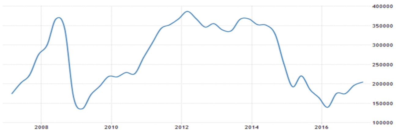
Figure-1. Export flows for the KSA (2008-2016)