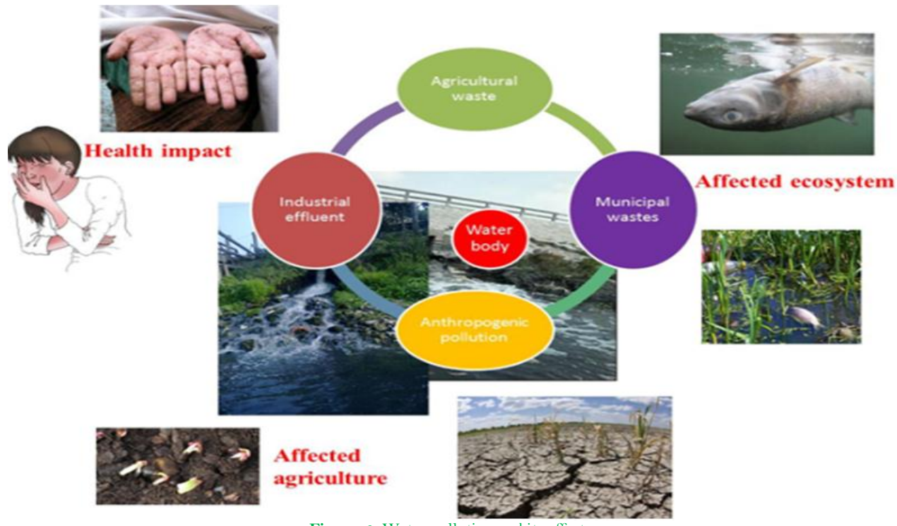
Figure-2. Water pollution and its effects.