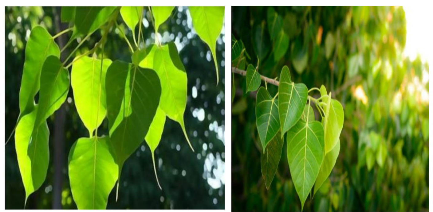
Figure-3. Dust deposition on Peepal plants at two different sites.