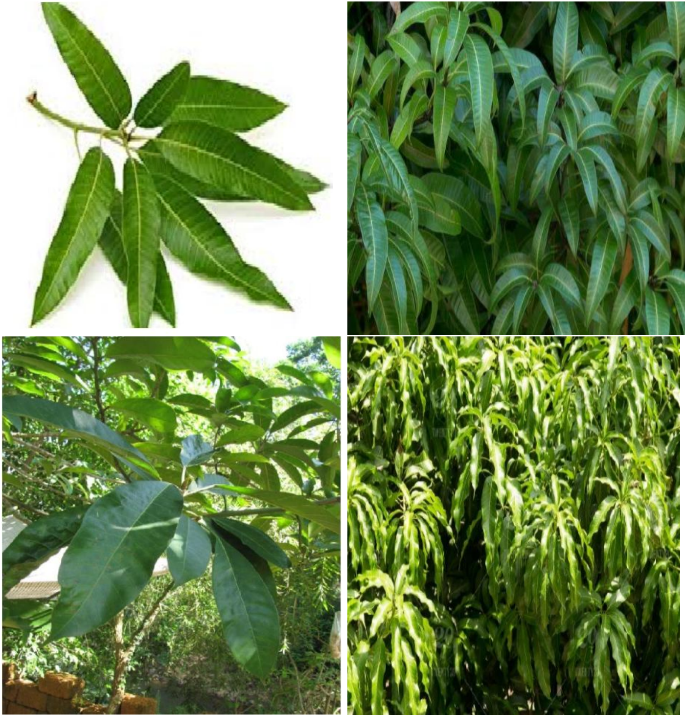
Figure-4. Dust deposition on Mango plants at two different sites.

Peepal tree >Mango tree: A superb correlation has been observed among the dust trapping and micro roughness of the full leaf vicinity. Roughness of top floor may be described because of presence of ridges and