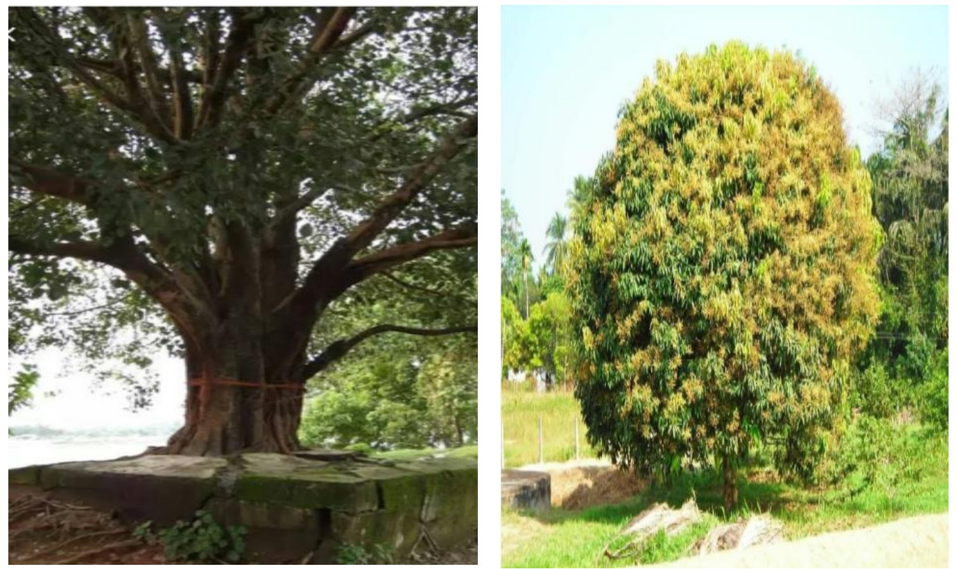
Figure-5. Dust deposition on common selected plants at two different sites.

Ficusreligiosa (Peepal tree) recognized for non-secular purpose. They are lengthy and huge trees. It is a great specie for dust trapping. The leaves of Peepal tree are very huge Figure 5. Therefore, with these characteristics, such species are ideal for trapping of dust. Hence it must be planted close to the roads and on locations in which pollutants stage is excessive.