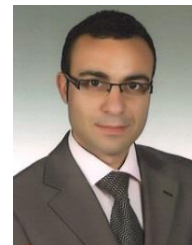
(✉ Corresponding Author)