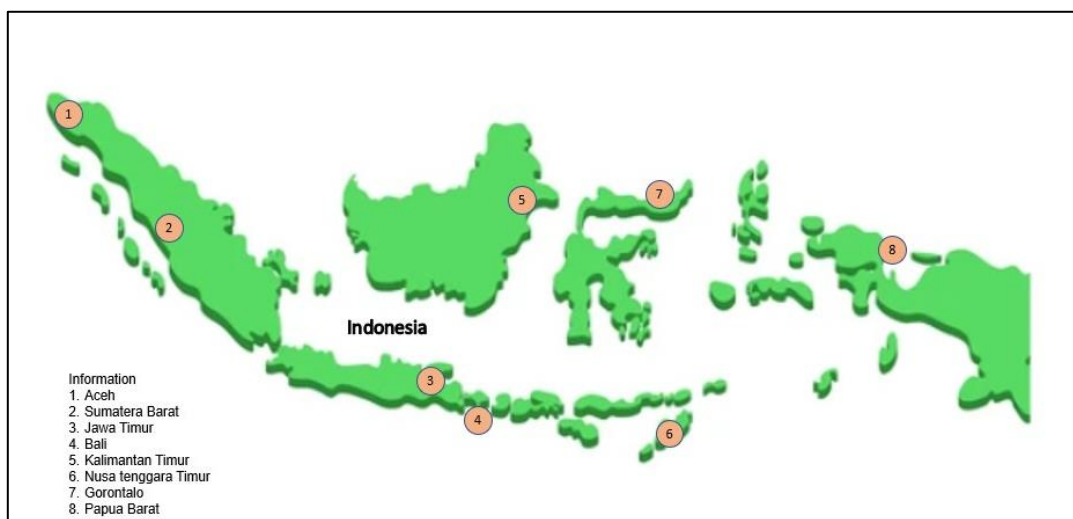
Figure 2. Distribution of the sample in the three regions of Indonesia.

The research sample was obtained using the random cluster sampling technique. The population was Indonesian students who were then randomly assigned to three regions of Indonesia, namely students from the western, central and eastern regions of Indonesia. Regional sampling is used for representation between regions in Indonesia. Meanwhile, the determination of rural and urban areas in the sample depends on the presence of students when taking online learning during the COVID-19 period. The sample area map is shown in Figure 2.