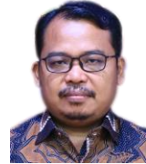
(✉ Corresponding Author)