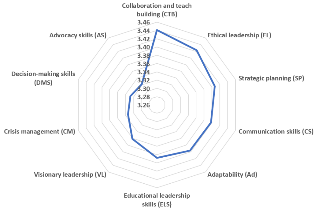
Figure 1. The teachers' assessment of elementary schools' principals of educational leadership traits.

The educational traits of the principals in elementary schools are still at the intermediate level. The average assessment of educational leadership skills (ELS) was 3.39. The lowest assessment was for advocacy skills (3.32) while the highest assessment was for emotional intelligence (EI) (3.47). The results showed that the EI was in the first rank as practiced skills followed by collaboration skills (CTB). The third rank of skills practiced was ethical leadership (EL). The strategic planning of the elementary schools' principals' skills was in the fourth rank (3.41). The fifth rank of practiced skills was for communication skills (CS) (3.40). The sixth rank was for adaptability (3.40). The visionary leadership was in the seventh position (3.36) while the decision-making skills (DMS) were in the ninth position (3.33) (see Figure 1).