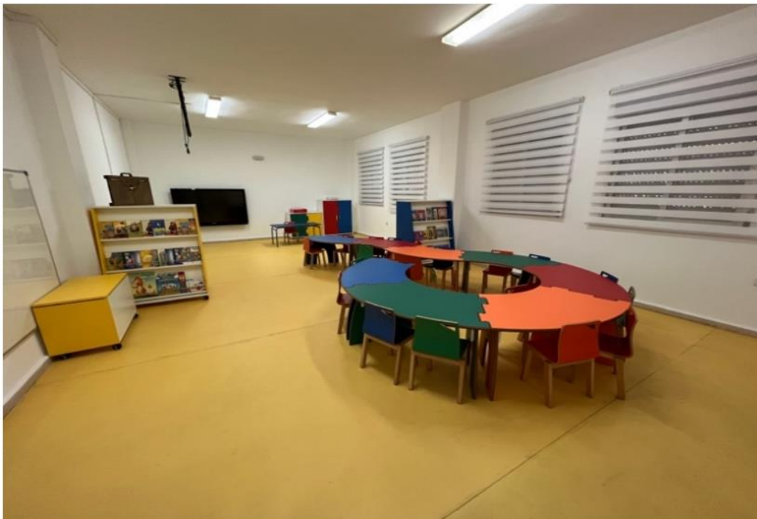
Figure 2. Recently renovated classroom at a primary education centre in the autonomous city of Ceuta.

Transforming students into active participants in their learning process (Parra-González, Segura-Robles, Cano, & López-Meneses, 2020; Valdivia, 2010) will be the main ingredient to achieve real methodological innovation in classrooms. This educational innovation relies on the educational space as an essential tool in the teaching-learning process providing students with an educational environment that fosters social relationships, a productive climate and actively involves all members of the educational community.